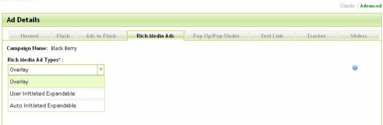
Fig. 3 - Creating the campaign